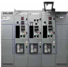
Low voltage switchgear