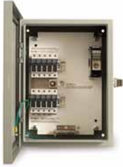
DC combiner boxes