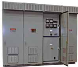
Medium voltage AC switchgear