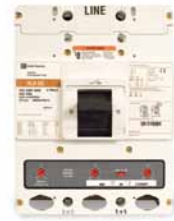
DC circuit breakers