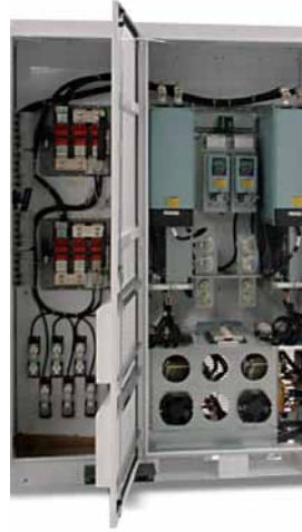
Solar inverters – 100kW through 1MW