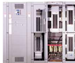
Integrated Power Assembly (IPA)