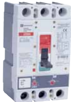
AC circuit breakers