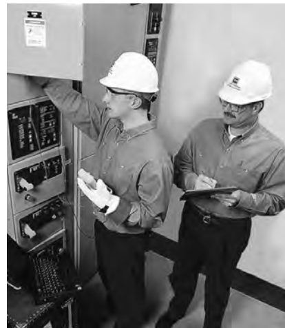
Our Power Systems Engineers Can Perform On-Site Studies

Power Systems Engineering is comprised of 30 power systems engineers. A core group is located in Pittsburgh, PA and the remainder of the engineers are located throughout the USA and Canada. The PSE charter is to provide analytical services to Eaton and their customers through power system studies and on-site investigations.