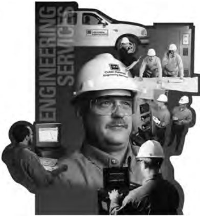
Eaton Offers a Wide Range of Engineering Services

You've just seen the innovative and powerful products that Eaton offers. Now take a look at their total solution organization — E ESS.