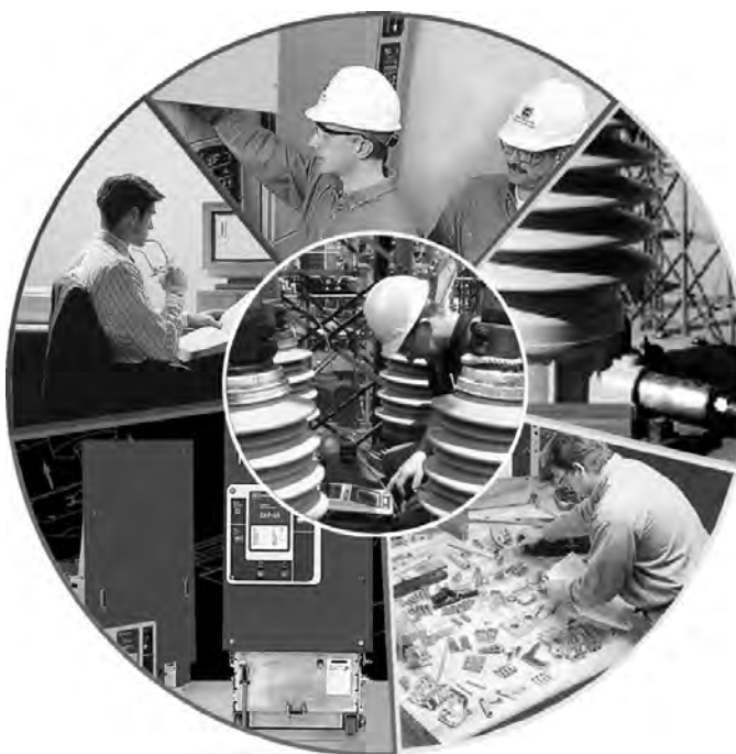
Eaton Offers a Wide Range of Products and Services