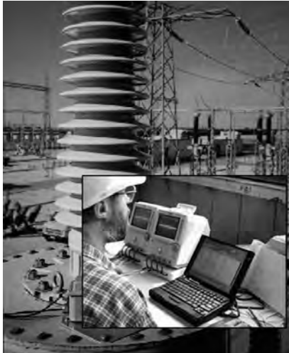
On-Line Monitoring and Partial Discharge Analysis

Eaton's Predictive Diagnostics group offers non-destructive testing technologies and sensors to assess the condition of medium and high voltage electrical equipment.