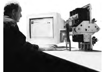
Pow-R-Master Software Database Tracking Can Save You Money and Time