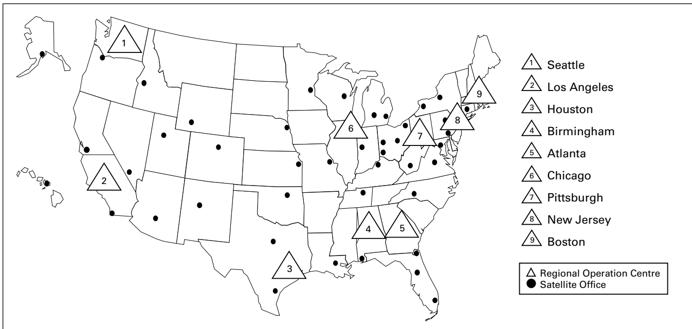
Figure J-2. U.S. Service Locations