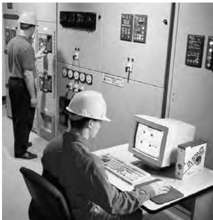
We Ensure Your Hardware, Software and Communication Networks Perform as a Seamless System.

The Automation Services Group (ASG) is a full-service systems integrator with proven expertise in power systems applications and material handling applications in the beverage, aggregate and warehouse industries. ASG provides a unique alternative to conventional manufacturer-integrator-contractor teams by: