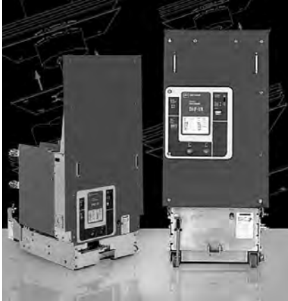
We Can Replace Your Vintage Air Magnetic Breakers With New Vacuum Breakers